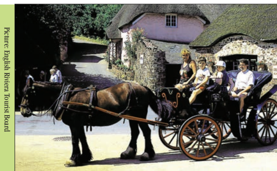
Cockington Village, Torquay