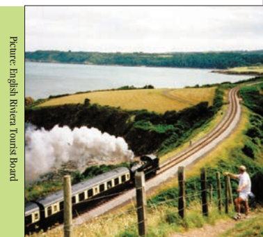
Paignton & Dartmouth Steam Railway